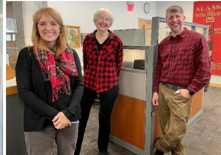
Alaskan Red Plaid Day: LAM staff celebrated our Alaskan snow by donning plaid shirts, scarves, and coats on January 19.